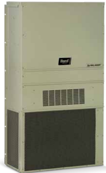
Wall-Mount™ Air Conditioner