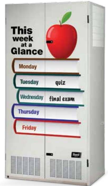
I-TEC® Series with graphic option