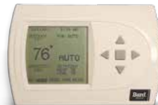
Temperature & Humidity Controller