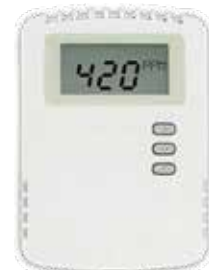
CO 2 Controller